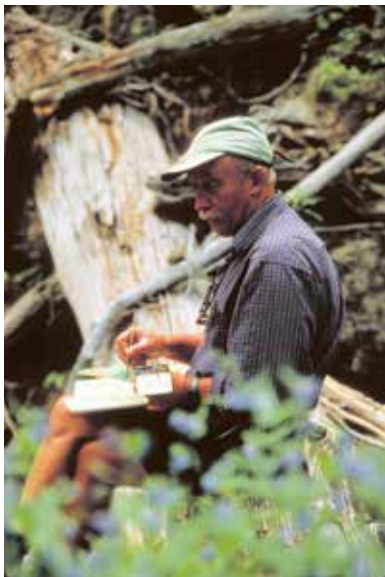
Painting on the Salmon River, Idaho, 2002