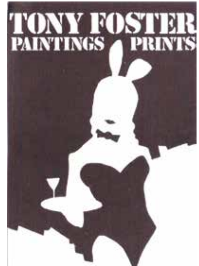
Exhibition announcement, 1976