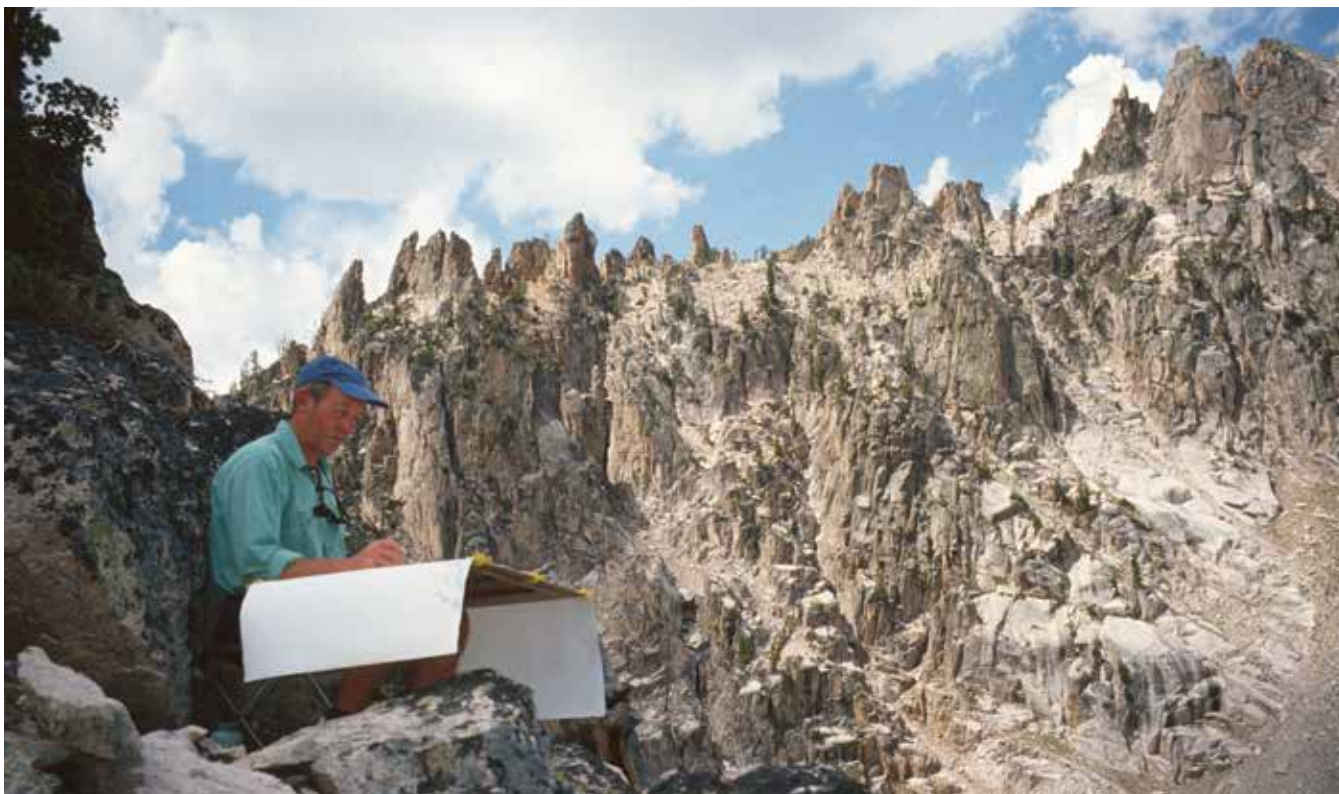
Painting in the Idaho Rockies, 1994