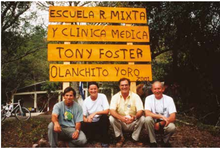
Escuela y Clinica Tony Foster, Honduras, 2001