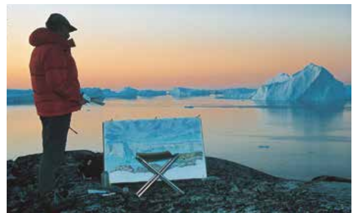
At dusk in Greenland, 2000