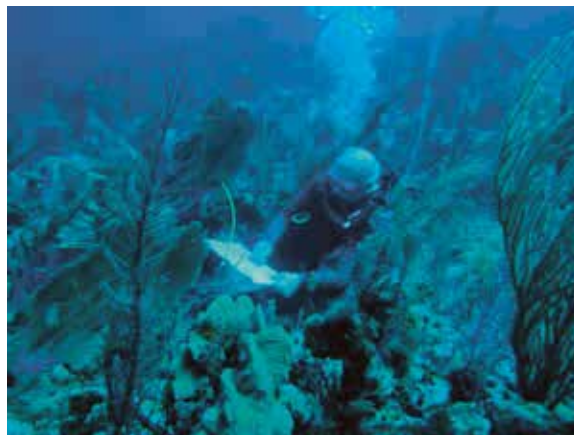
Painting underwater in the Maldives, 2007