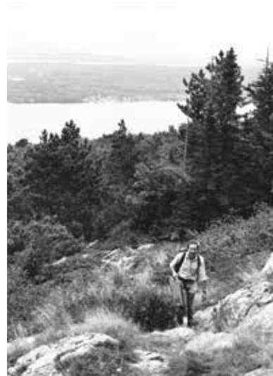
Climbing Mount Kineo, Maine, 1984