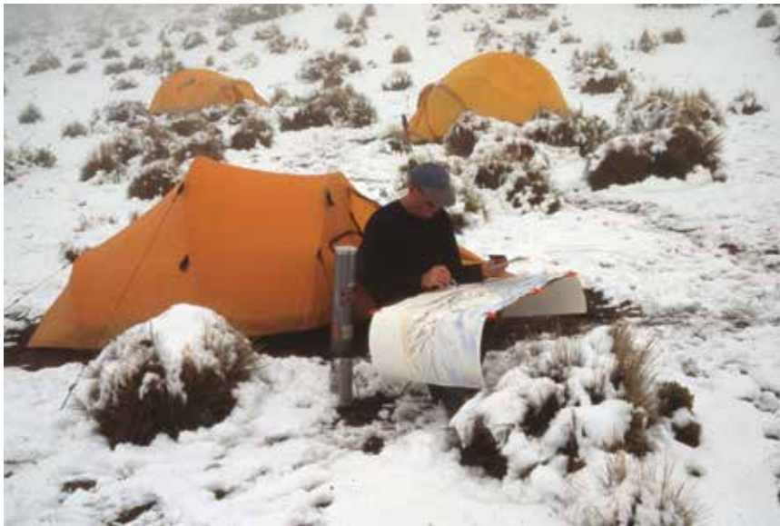
Painting at the Nevado Sajama volcano, Bolivia, 1997