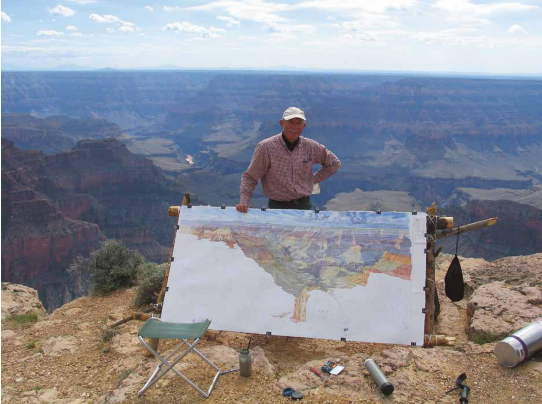
Painting Point Sublime in the Grand Canyon, 2004