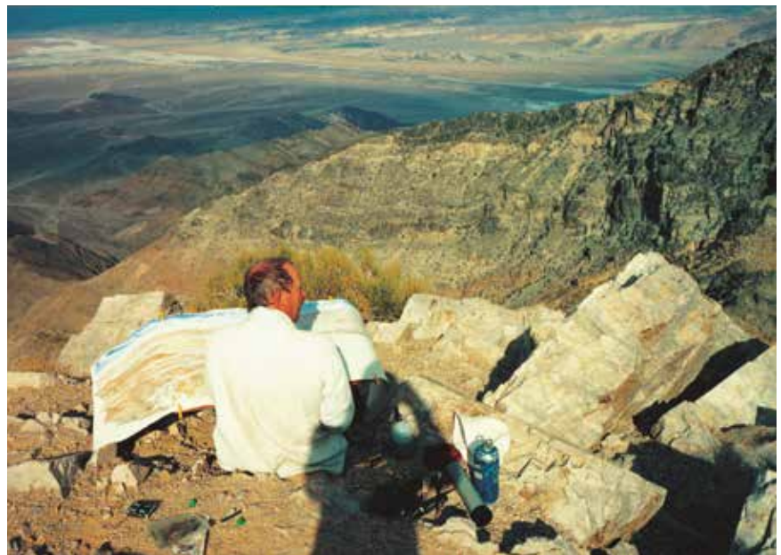
Painting Death Valley from Aguerberry Point, 1991