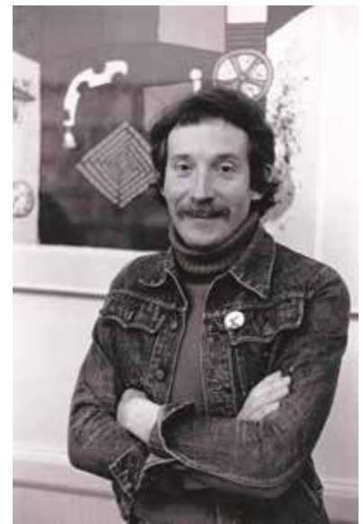
Working at South West Arts Council