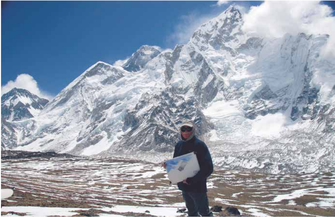
At 17,800 feet on Kala Patthar, Nepal, 2006