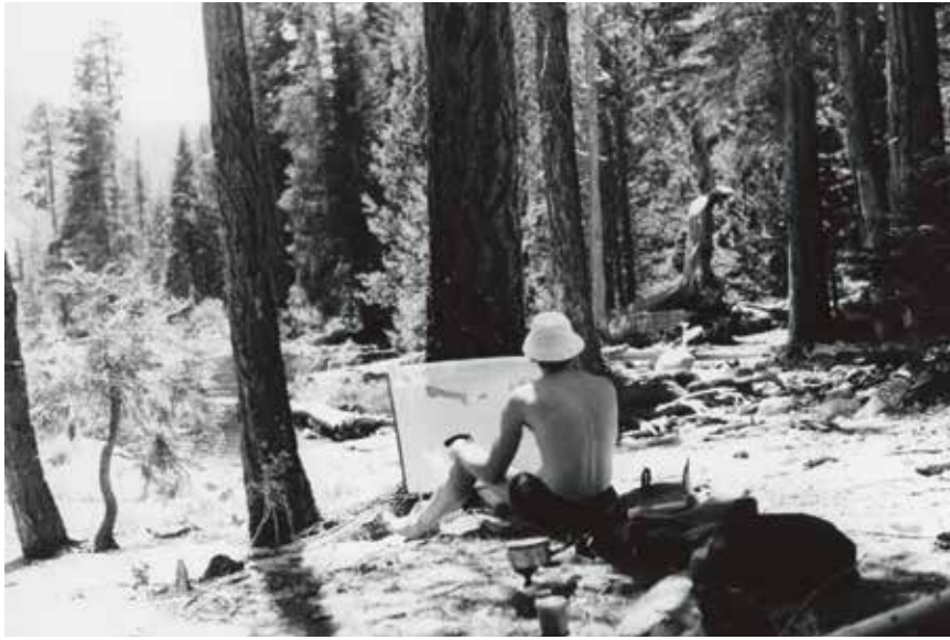
Painting Merced River in Yosemite Valley, California, 1986