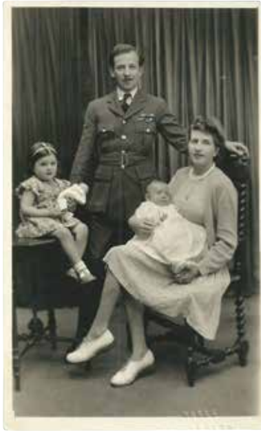
The Foster family, c. 1946