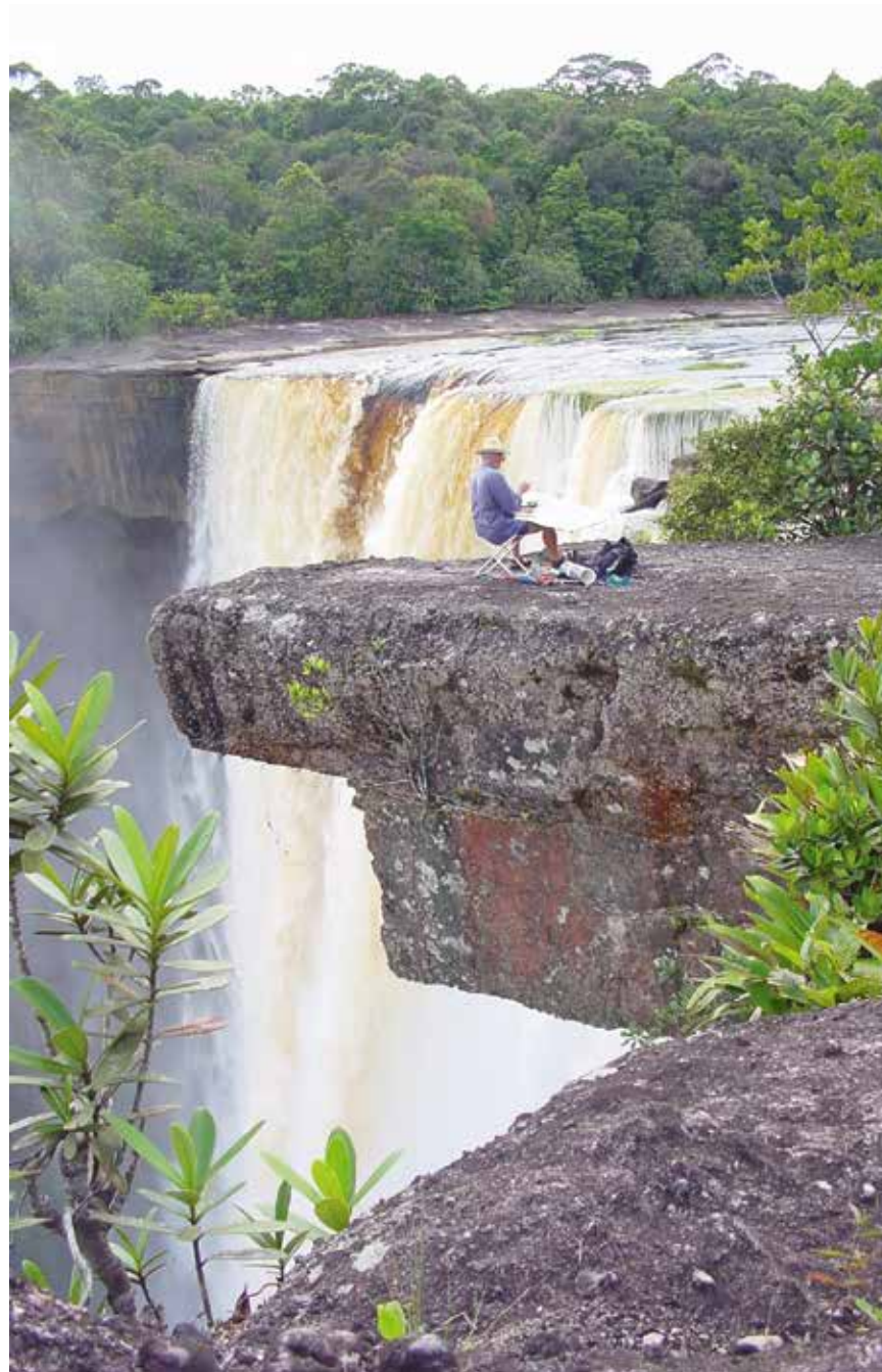
Painting Kaieteur Falls, Guyana, 2002