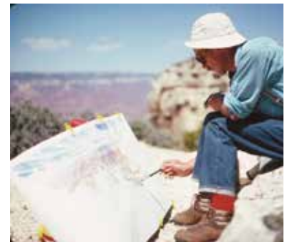
Painting in the Grand Canyon, 1989