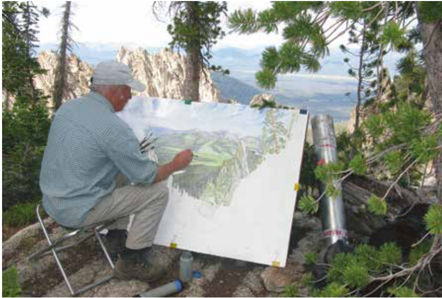
Painting in Idaho for Secret Sites , 2009