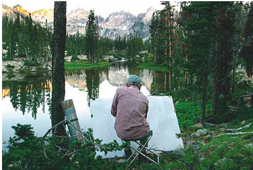
Painting on the ponds below Alice Lake, Idaho, 2006