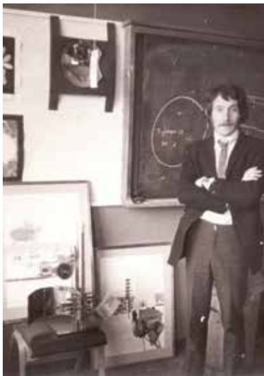
Teaching art at New Parks Boys School, c. 1970