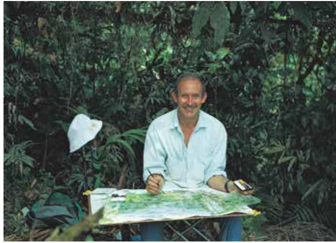
Painting in Costa Rica, 1991