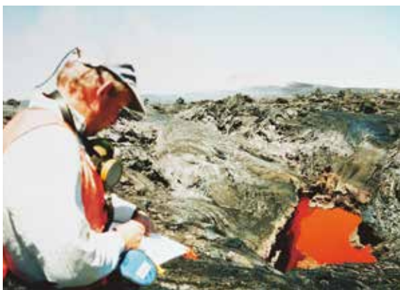
Painting a lava tube in Hawaii, 1997