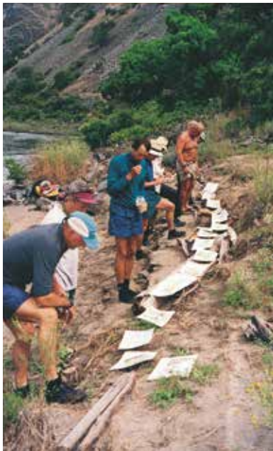
First viewing of The Whole Salmon , Salmon River, Idaho, 2002

Foster's artwork appears in the spring issue of Watercolor magazine.